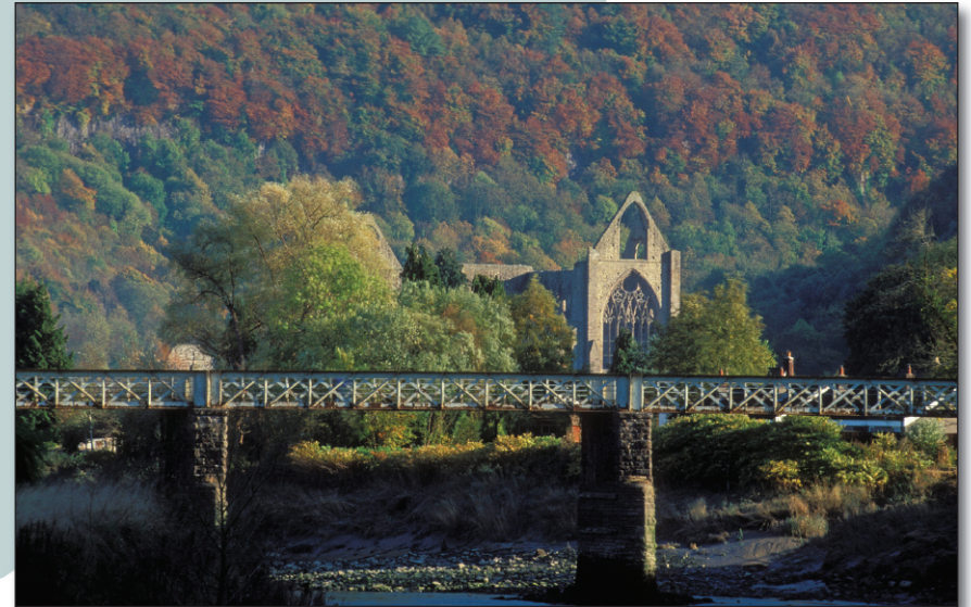
Tintern Abbey and Old Railway Bridge