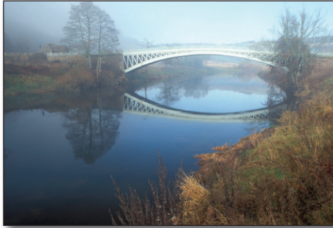
Bigsweir Bridge near Llandogo