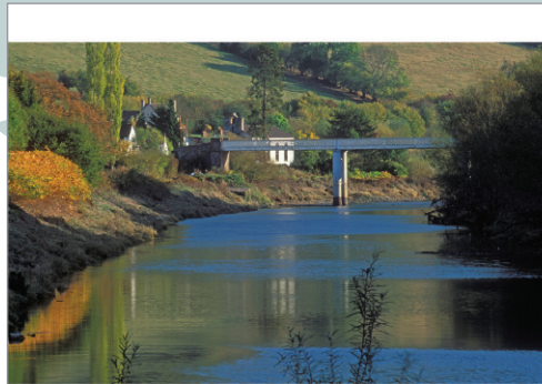
Brockweir Bridge This road bridge forms the border crossing between England and Wales. The shot was taken from the path of the Wye Valley Walk.