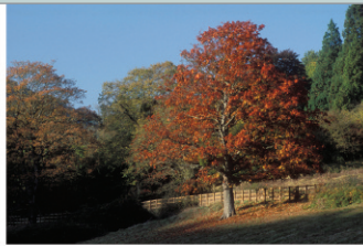
Near Brockweir in Autumn The autumn colours were really vibrant when I walked this section of the Wye Valley Walk at Brockweir.