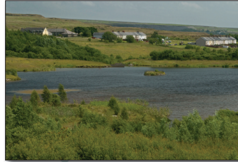
Garn Ponds, Blaenavon